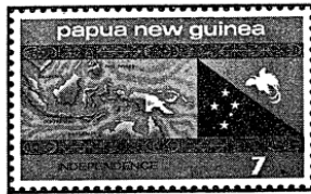
Issue hails newest independent nation

The island, 100 miles north of Australia, actually has three parts. The western half was once Netherlands New Guinea and is now part of Indonesia. The northeastern part is New Guinea. The southeastern part is Papua. The two have since 1952 been combined in a joint