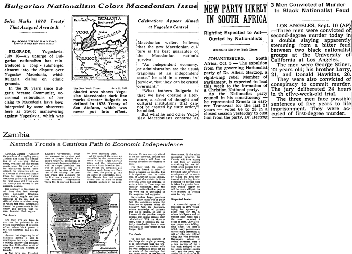
Figure A5. Some News Report Examples from New York Times for SSNM=0 (Based on Rule A7vi)